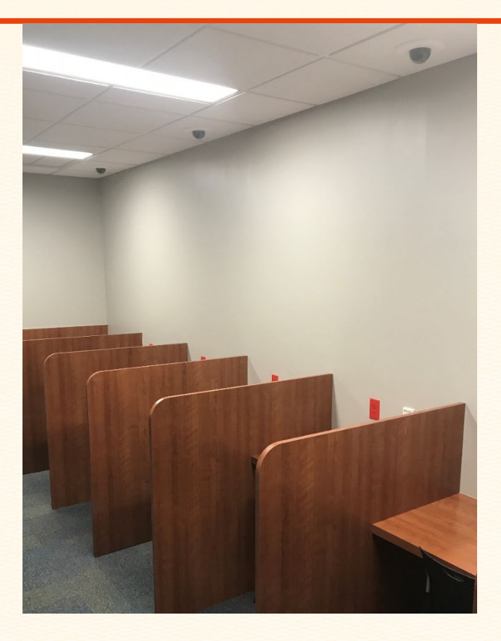
Low Distraction Environment